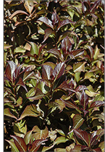
Dark Horse Weigela foliage

Dark Horse Weigela makes a fine choice for the outdoor landscape, but it is also well-suited for use in outdoor pots and containers. Because of its height, it is often used as a 'thriller' in the 'spiller-thriller-filler' container combination; plant it near the center of the pot, surrounded by smaller plants and those that spill over the edges. It is even sizeable enough that it can be grown alone in a suitable container. Note that when grown in a container, it may not perform exactly as indicated on the tag - this is to be expected. Also note that when growing plants in outdoor containers and baskets, they may require more frequent waterings than they would in the yard or garden. Be aware that in our climate, most plants cannot be expected to survive the winter if left in containers outdoors, and this plant is no exception. Contact our experts for more information on how to protect it over the winter months.