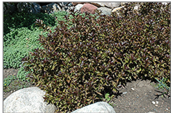
Dark Horse Weigela