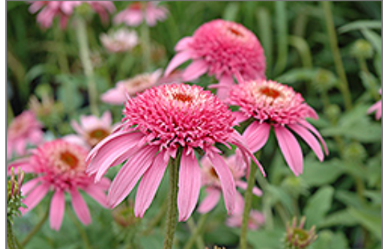
Cone-fections Pink Double Delight Coneflower flowers

Cone-fections Pink Double Delight Coneflower is recommended for the following landscape applications;