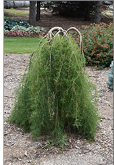
Walker Weeping Peashrub

This shrub does best in full sun to partial shade. It prefers dry to average moisture levels with very well-drained soil, and will often die in standing water. It is considered to be drought-tolerant, and thus makes an ideal choice for xeriscaping or the moisture-conserving landscape. It is not particular as to soil type or pH, and is able to handle environmental salt. It is highly tolerant of urban pollution and will even thrive in inner city environments. This is a selected variety of a species not originally from North America.