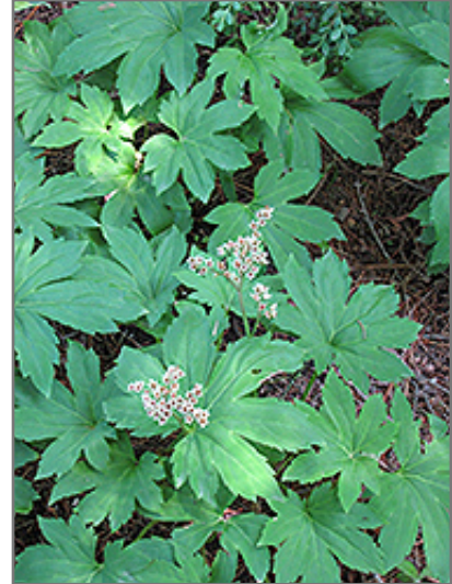
Crimson Fans Mukdenia flowers

Crimson Fans Mukdenia is a fine choice for the garden, but it is also a good selection for planting in outdoor pots and containers. It is often used as a 'filler' in the 'spiller-thriller-filler' container combination, providing a mass of flowers and foliage against which the larger thriller plants stand out. Note that when growing plants in outdoor containers and baskets, they may require more frequent waterings than they would in the yard or garden. Be aware that in our climate, most plants cannot be expected to survive the winter if left in containers outdoors, and this plant is no exception. Contact our experts for more information on how to protect it over the winter months.