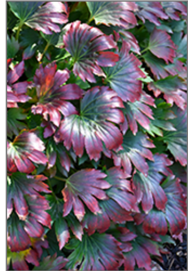
Crimson Fans Mukdenia foliage

Crimson Fans Mukdenia is recommended for the following landscape applications;