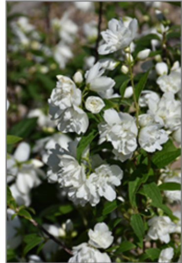
Snow Dwarf Mockorange flowers

This shrub does best in full sun to partial shade. It prefers to grow in average to moist conditions, and shouldn't be allowed to dry out. It is not particular as to soil type or pH. It is highly tolerant of urban pollution and will even thrive in inner city environments. This particular variety is an interspecific hybrid.