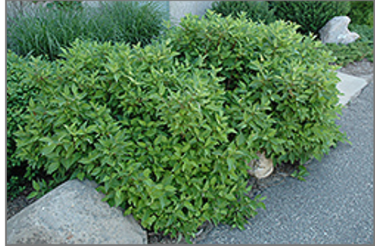
Firedance Dogwood

Firedance Dogwood is recommended for the following landscape applications;