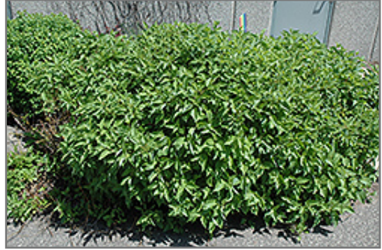
Firedance Dogwood

This shrub does best in full sun to partial shade. It is an amazingly adaptable plant, tolerating both dry conditions and even some standing water. It is not particular as to soil type or pH. It is highly tolerant of urban pollution and will even thrive in inner city environments. This is a selection of a native North American species.