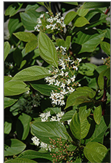
Firedance Dogwood flowers