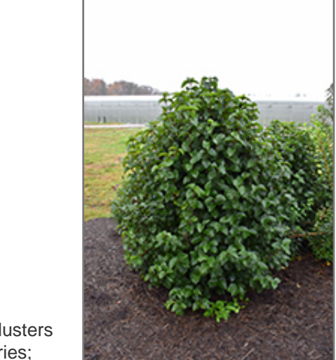
All That Glitters Viburnum

P.O. Box 249, 2350 West Wayzata Blvd., Long Lake, MN 55356 www.ottenbros.com | 952-473-5425 | fax 952-473-7232