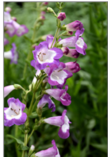
Pretty Petticoat Beard Tongue flowers