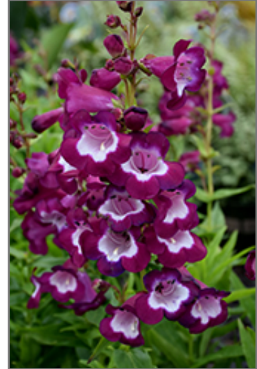
Pretty Petticoat Beard Tongue flowers

Pretty Petticoat Beard Tongue is recommended for the following landscape applications;