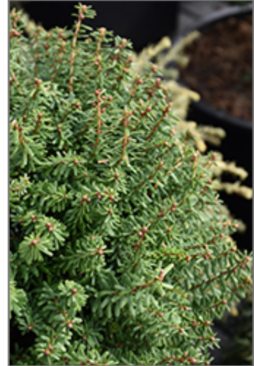
Minikin Japanese Hemlock foliage