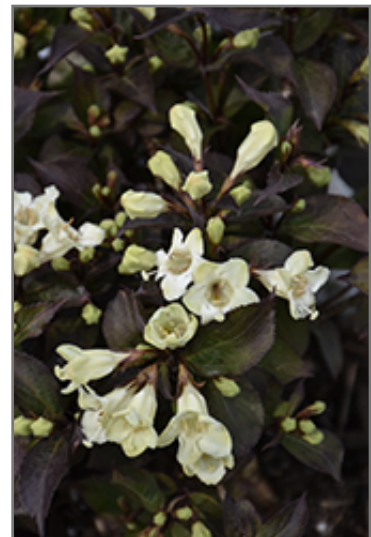
Wine & Spirits Weigela flowers