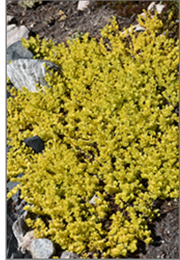
Goldilocks Creeping Jenny

Goldilocks Creeping Jenny is a fine choice for the garden, but it is also a good selection for planting in outdoor containers and hanging baskets. Because of its spreading habit of growth, it is ideally suited for use as a 'spiller' in the 'spiller-thriller-filler' container combination; plant it near the edges where it can spill gracefully over the pot. Note that when growing plants in outdoor containers and baskets, they may require more frequent waterings than they would in the yard or garden. Be aware that in our climate, most plants cannot be expected to survive the winter if left in containers outdoors, and this plant is no exception. Contact our experts for more information on how to protect it over the winter months.