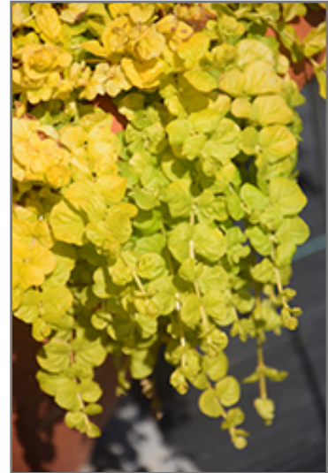
Goldilocks Creeping Jenny foliage

Goldilocks Creeping Jenny is recommended for the following landscape applications;