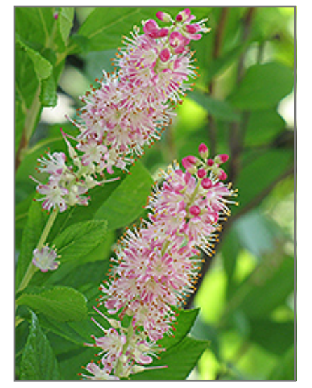
Ruby Spice Summersweet flowers