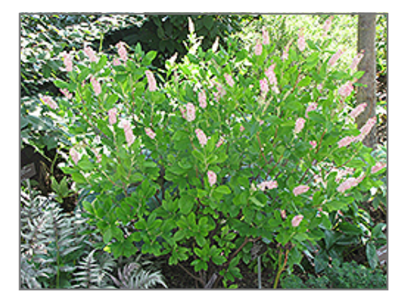
Ruby Spice Summersweet in bloom

P.O. Box 249, 2350 West Wayzata Blvd., Long Lake, MN 55356 www.ottenbros.com | 952-473-5425 | fax 952-473-7232